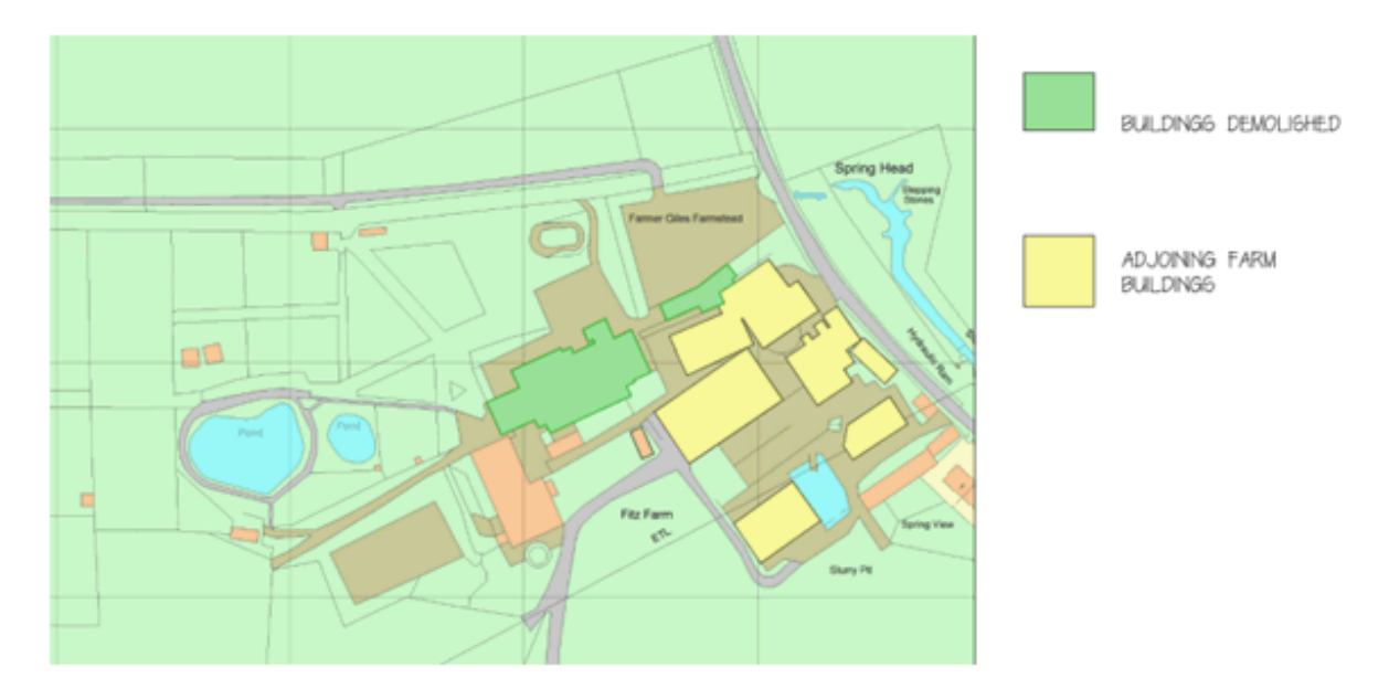
Plan showing buildings to be demolished

and stored mobile home would also be removed. All land under the removed buildings and car park would be restored to pasture, although with a driveway retained to serve the proposed dwelling.